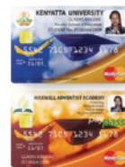
Kenya (Equity Bank)