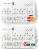
Kenya (Commercial Bank of Africa)