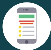
Mobile App for Android OS