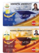
Kenya (Equity Bank)